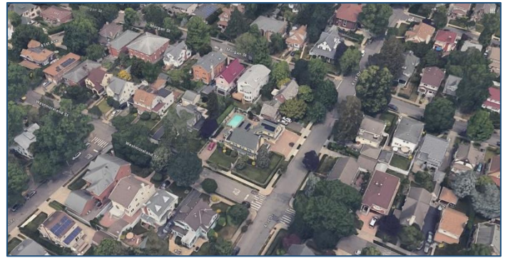
Little Neck, Queens