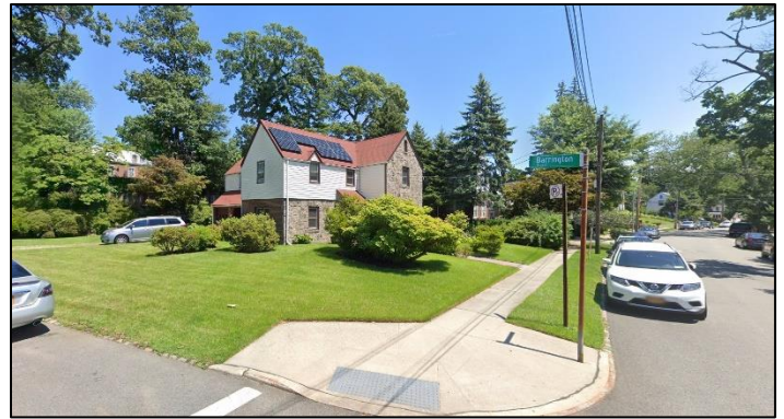
Jamaica Estates, Queens